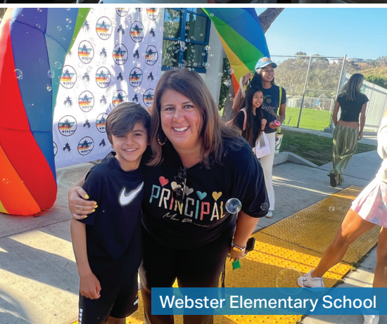
Webster Elementary School