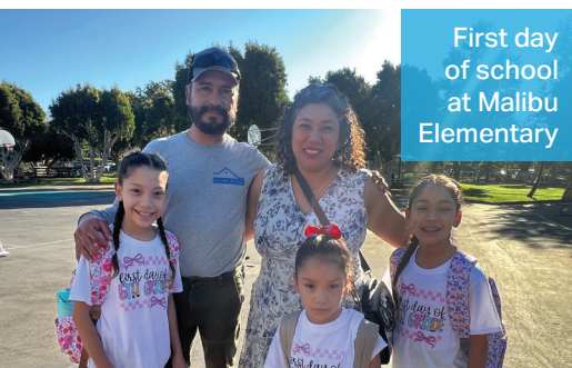
First day of school at Malibu Elementary