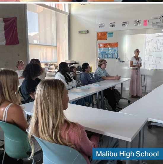
Malibu High School