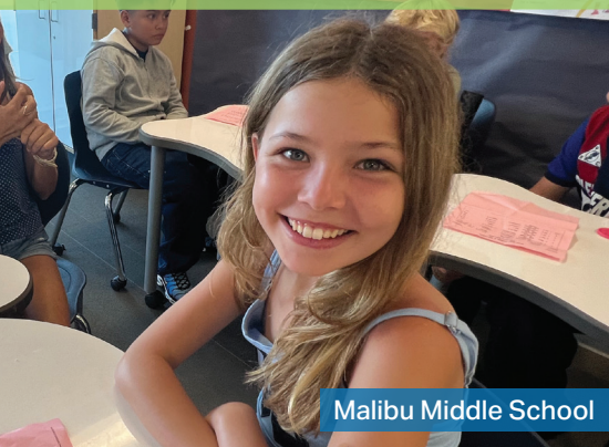
Malibu Middle School